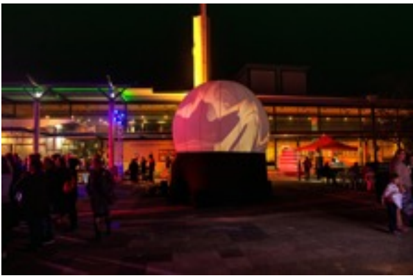
The Hydrodome at the WA Regional Arts Summit KAYA Square Mandurah - the transparent inflatable dome.