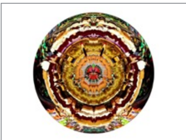
Synaesthesia Circle FILE Sao Paulo 2019 | Circular Cinema - collaboration with Colin Potter

Also three sequences from the STRETCHED video on the 45 metre tower. A Stretch Arts Festival, City of Mandurah collaboration. Shown daily May onwards 2018